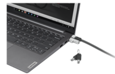
NanoSaver Cable Lock from Lenovo