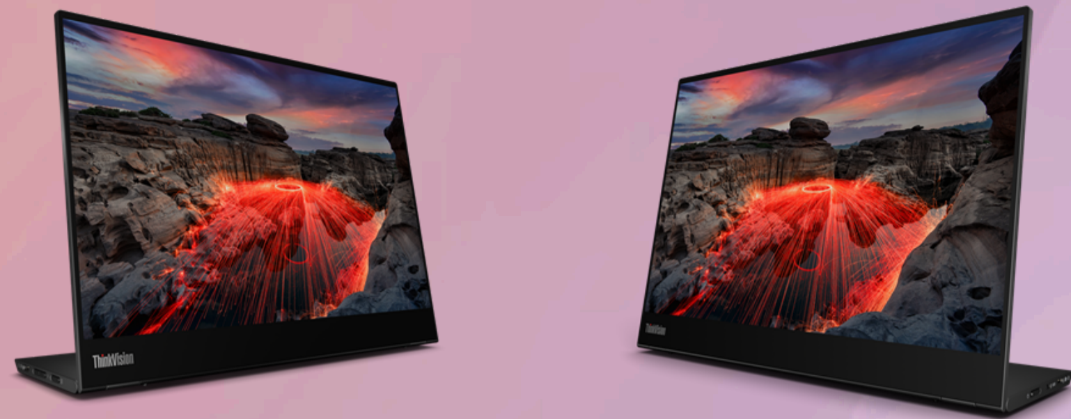
The product images are for illustration purposes only. Actual product appearance, ports, keyboard layout, and accessories may vary by model.